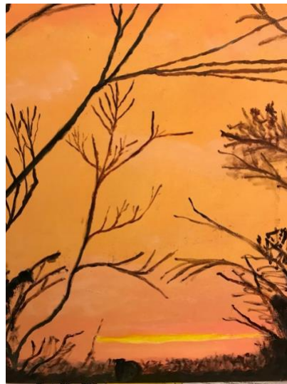
Title: Dusk at West 100th Street By Ken Witty

From Ken: I was walking home one evening and saw this sky as the sun descended over the Hudson River. In seconds the light turned from orange to purple. I used my I-Phone to photograph the scene at different moments. I painted from two of them - this one and a second canvas in a purple cast.